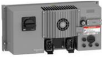
4~5.5kW with Fan